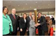
A T-shirt launcher elicits reactions from participants at the recent technology showcase.

highlighted NSF-funded research projects on education technology from several NSF directorates. Interactive exhibits at the showcase included shooting a T-shirt into the air using a device developed by the PBS show "Design Squad", engaging with robots, observing the impact of earthquakes and trying out educational computer games. Over 450 people attended the showcase including Senate Majority Leader Harry Reid, Senators Jeff Bingaman, Kay Hagan, Ted Kaufman and Patty Murray, and Representatives Peter Welch and Harry Teague. Read more about the showcase here .