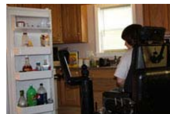
A new robotics system used in food preparation assistance.