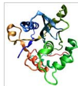
A folded protein.

Through NSF Small Business Technology Transfer awards , Swartz and Sutro have collaborated to reduce production time and costs for the proprietary technique. In addition, Sutro has optimized the system such that it can be scaled up from microliter-sized containers to 100-liter production vessels, allowing for predictability from the research bench through production. One area of focus is manufacturing IGF-1 (insulin-like growth factor-1), which may have potential for diabetes treatment. The team has found high expression yields of antibody fragments and whole antibodies using the method and are now investigating the manufacture of protein-based vaccines.