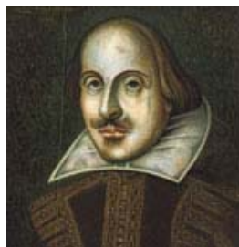
William Shakespeare.