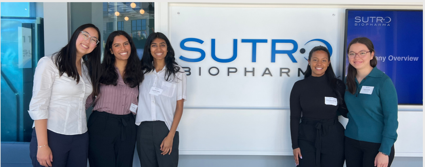
Picture from 1st day at Sutro - 6.20.2023