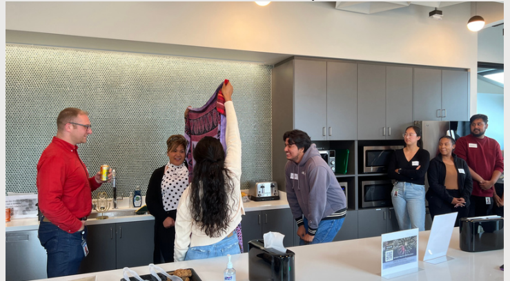
Mentor & Mentee Lunch