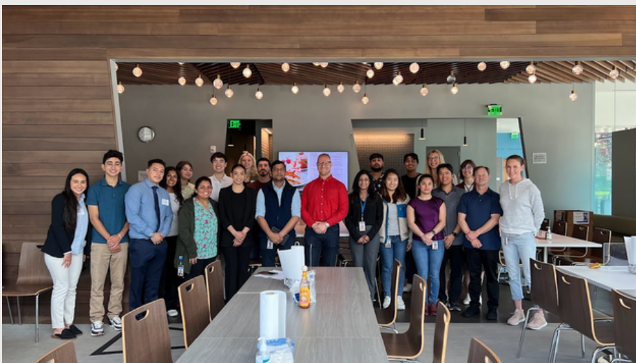
Pictured: 1st cohort & Mentors