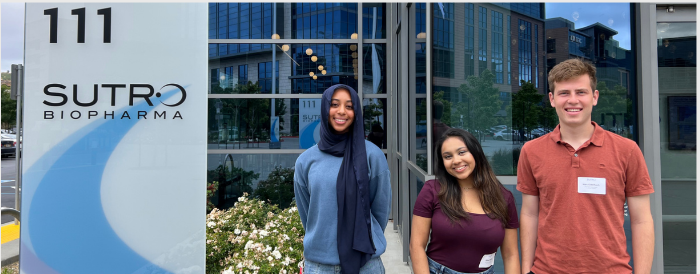
Picture from 1st day at Sutro - 6.12.2023