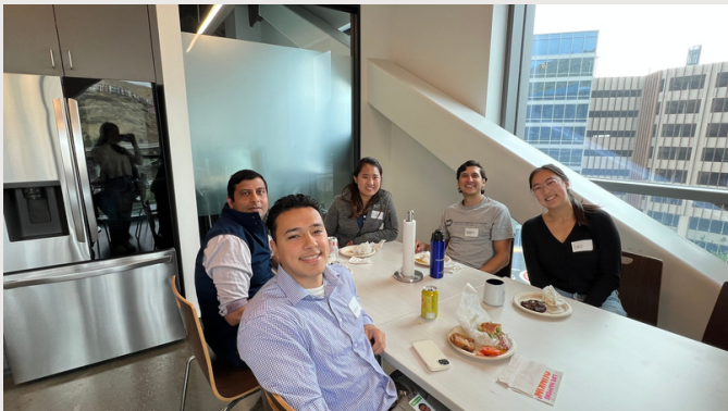
Mentor & Mentee Lunch