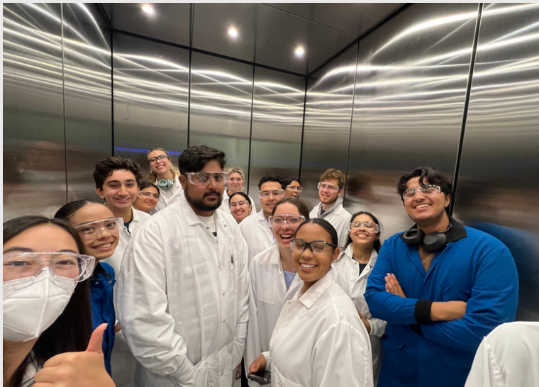
Picture from Lab Tours