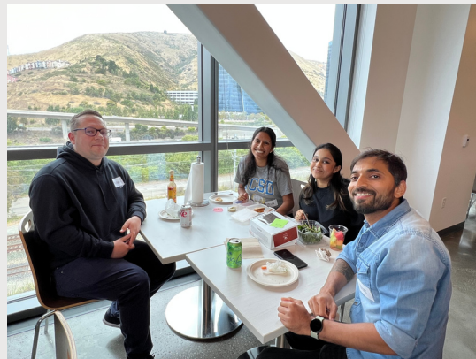
Mentor & Mentee Lunch