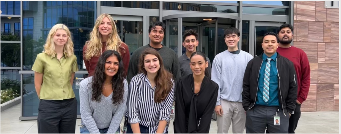
Picture from 1st day at Sutro - 6.5.2023