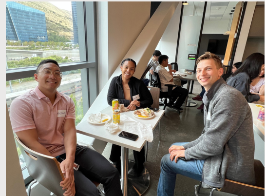
Mentor & Mentee Lunch