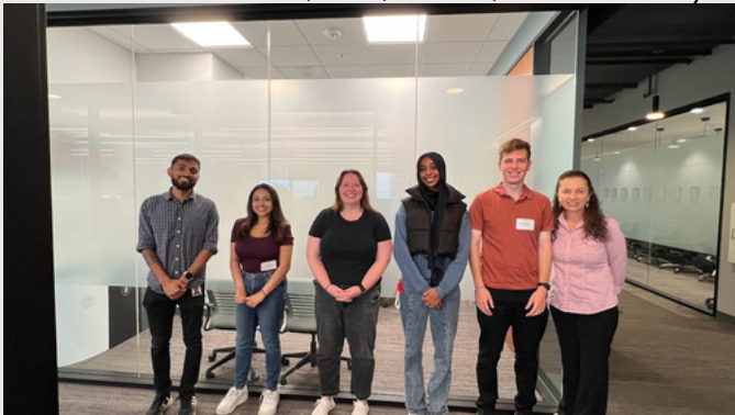
Pictured: 2nd cohort & Mentors