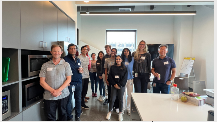
Mentor & Mentee Lunch